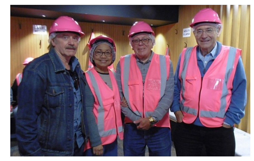
Some of the trippers in their nifty safety gear – perhaps we could make it the Club uniform: