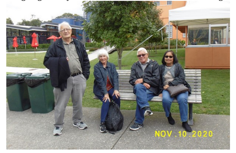
Safety was paramount ▼ ►