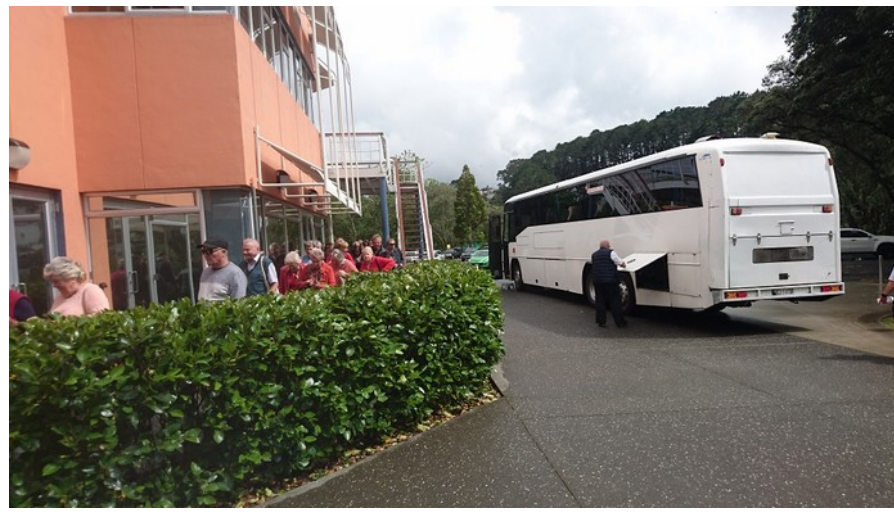
Arriving in grand style \blacktriangle Some of the assembled throng \checkmark

This tour is highly recommended in online reviews, and I would endorse that. For those who didn't go because of the stair climbing involved, and use of walking sticks and strollers not being allowed, I would suggest going to Chelsea just to see the visitor's centre and Heritage Park. There were people there doing just that.