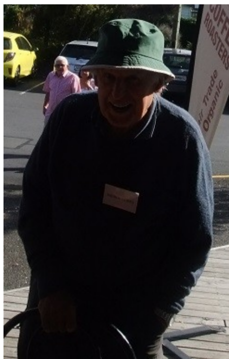
Not just the Usual Suspect