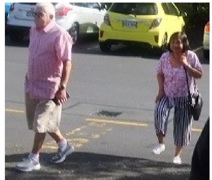
Others strolled in later

We all obeyed the rules and refrained from skateboarding on the wooden deck (or anywhere else)