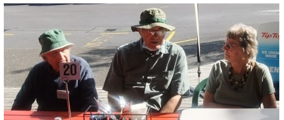
Two more hats